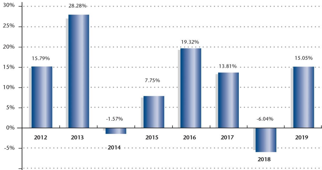
Caldwell Canadian Value Momentum Fund - Series A