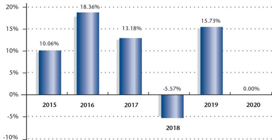
Caldwell Canadian Value Momentum Fund - Series F