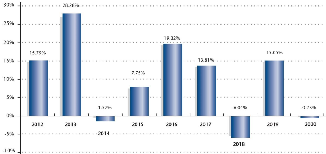
Caldwell Canadian Value Momentum Fund - Series A

For the years ended December 31 and the semi-annual period ended June 30, 2020